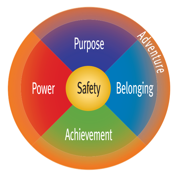
Figure 1. The Model of Leadership and Service

Frankl himself was strongly influenced by Russian author Leo Tolstoy (1828-1910) who explored human suffering in great depth and called for responding with love: